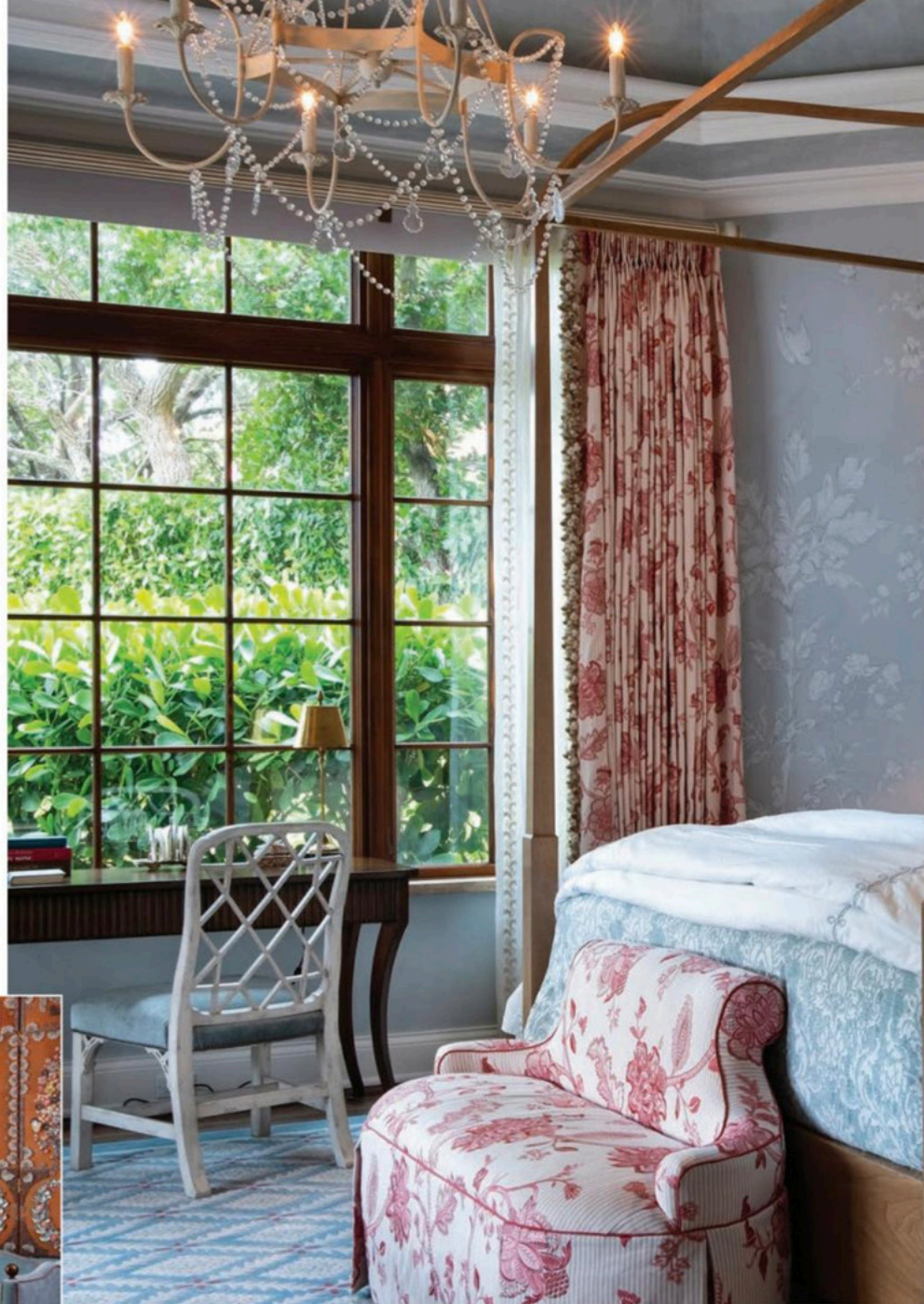
ABOVE: Beneath the illuminated, double tray ceilings of the master bedroom, a Swedish crystal chandelier lights the French Country-style gilded iron bed. Patterns echo around the room, tying the design together: the drapes and small settee, the textured bedspread and lacey wall designs, a tiny gilded desk lamp and the large, elegant bed.