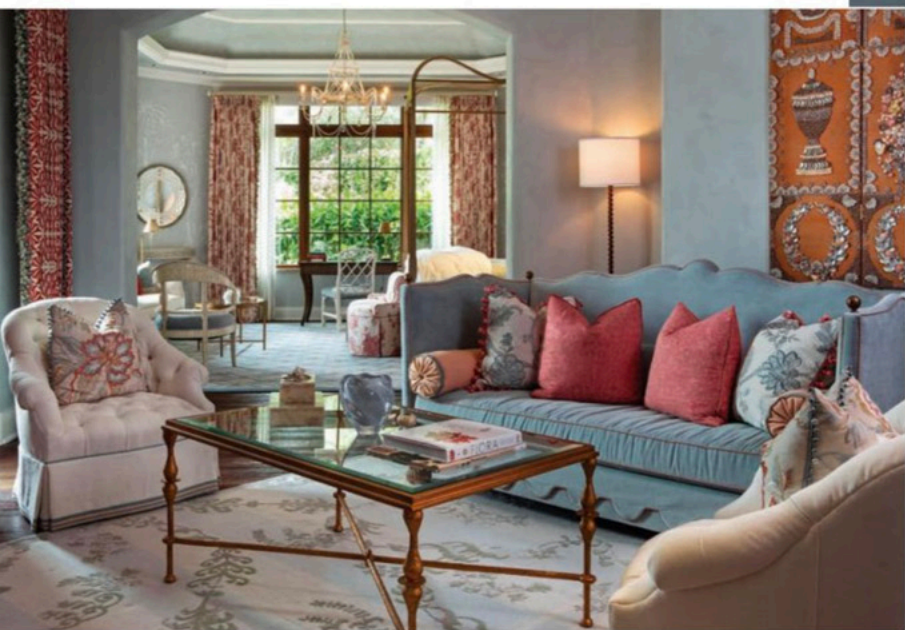
LEFT: Adjacent to the master bedroom, the private sitting room retains a familiar palette, popped by the salmon hues of a three-paneled screen featuring a wreath and vase design created from shells embroidered on fabric.