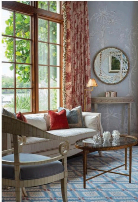
ABOVE: At one end of the master bedroom, an intimate seating area provides a space for relaxation. The patterns in the drapes, rug, wall work, and mirror are balanced by the tranquility of the cream-colored sofa and dusky-blue chair. Walsh creates unity and calm using a repeating rose and blue color palette.